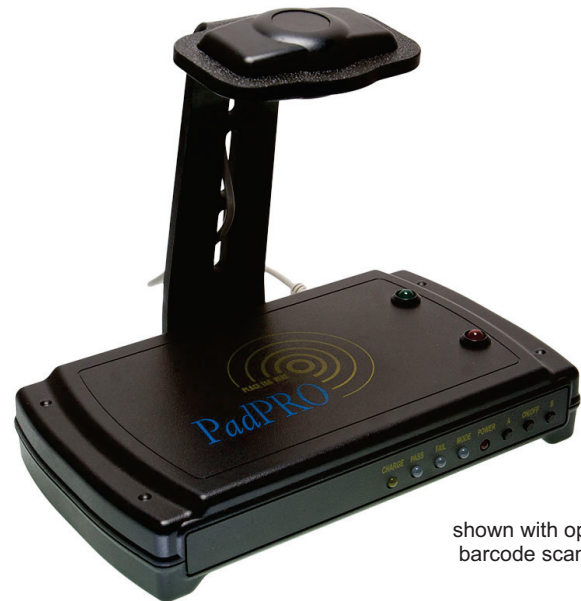
shown with optional barcode scan arm

Fully compatible with other ExpoTools equipment